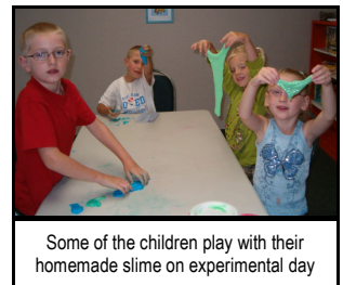
Some of the children play with their homemade slime on experimental day

Keep your eyes peeled for information about next years Free Day Camps for Kids.